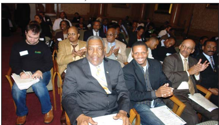
CACCI's Power-Packed Breakfast Meeting was held at the Historic Brooklyn Borough Hall, recently.